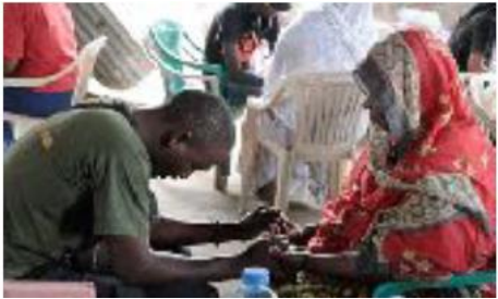
The Iron Lady