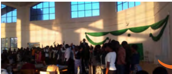
University students encountered the gospel and 50 came to Christ